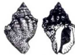
Florida Rock Shell